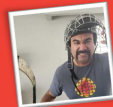
Saket - Finance

Check out their fundraising page to see their amazing results!